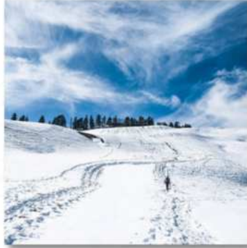
Highest Rolling Meadows