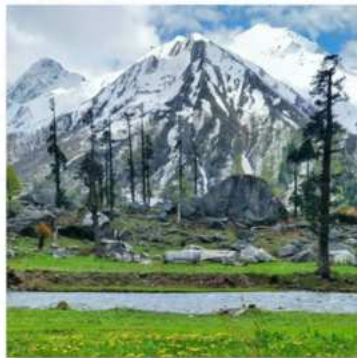
Flora & Fauna